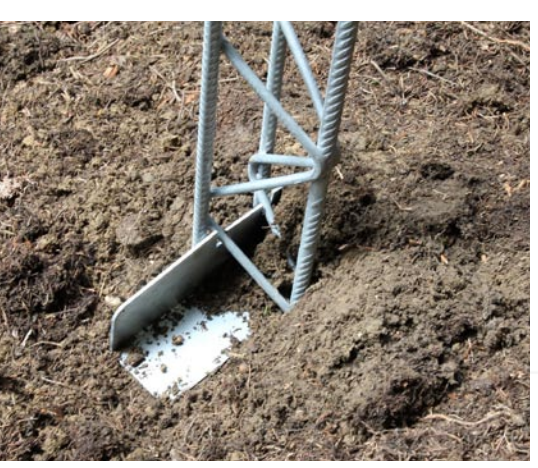
Sink protection support