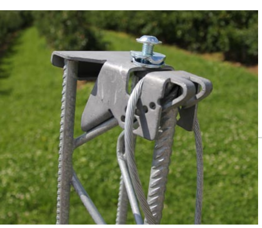
Head section with anchor rope